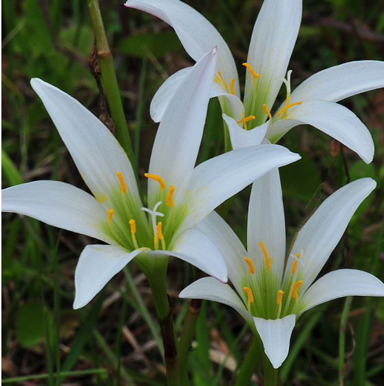
Photo by Roger Hammer. Photograph belongs to the photographer who allows use for FNPS purposes only. Please contact the photographer for all other uses.