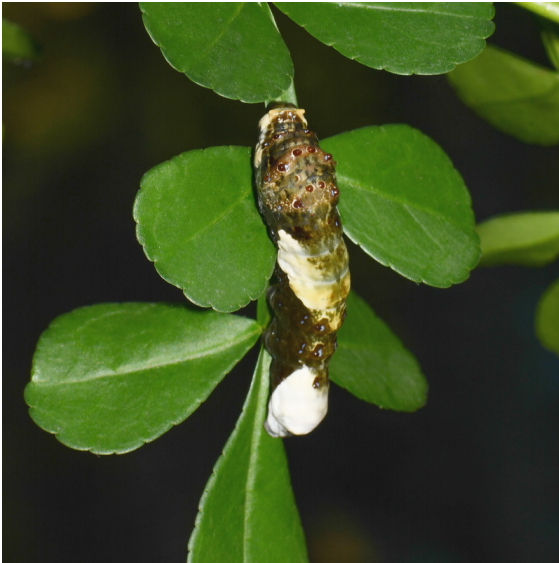
Photo by Roger Hammer. Photograph belongs to the photographer who allows use for FNPS purposes only. Please contact the photographer for all other uses.