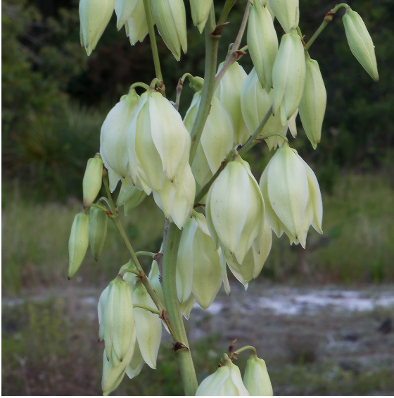
Photo by Roger Hammer. Photograph belongs to the photographer who allows use for FNPS purposes only. Please contact the photographer for all other uses.