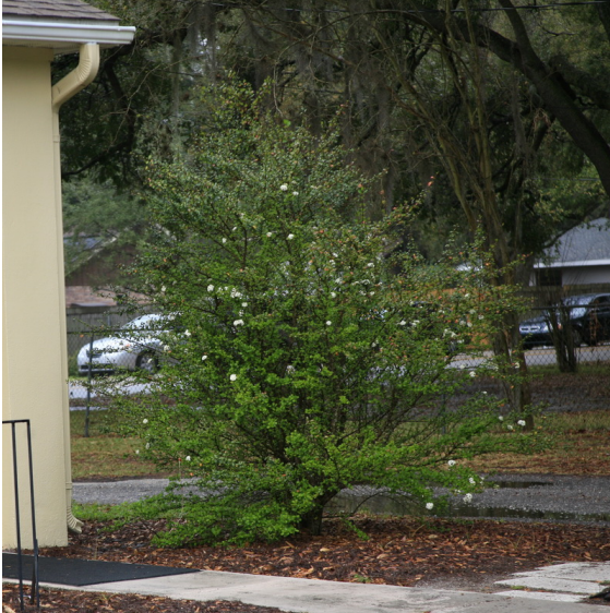
Photo by Shirley Denton, Suncoast Chapter FNPS. Photograph belongs to the photographer who allows use for FNPS purposes only. Please contact the photographer for all other uses.