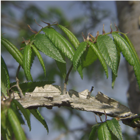
Photo by Shirley Denton. Photograph belongs to the photographer who allows use for FNPS purposes only. Please contact the photographer for all other uses.