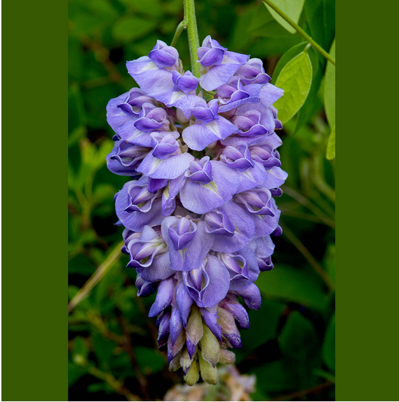
Photo by Roger Hammer. Photograph belongs to the photographer who allows use for FNPS purposes only. Please contact the photographer for all other uses.