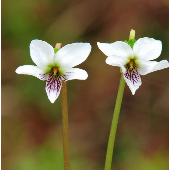
Photo by Roger Hammer. Photograph belongs to the photographer who allows use for FNPS purposes only. Please contact the photographer for all other uses.