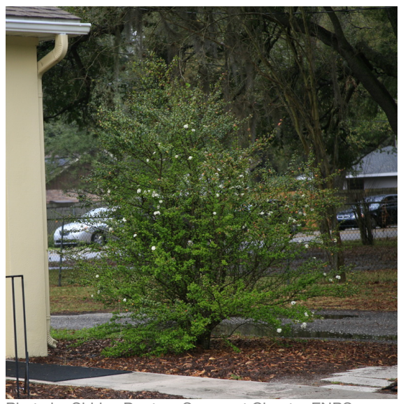
Photo by Shirley Denton, Suncoast Chapter FNPS. Photograph belongs to the photographer who allows use for FNPS purposes only. Please contact the photographer for all other uses.