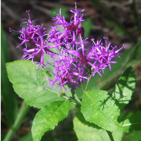
Photo by Roger Hammer. Photograph belongs to the photographer who allows use for FNPS purposes only. Please contact the photographer for all other uses.