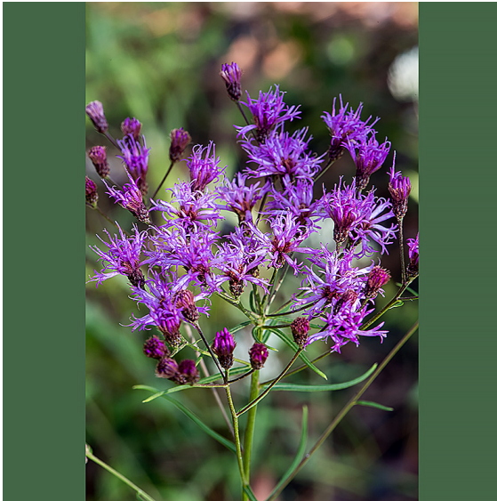
Photo by Roger Hammer. Photograph belongs to the photographer who allows use for FNPS purposes only. Please contact the photographer for all other uses.