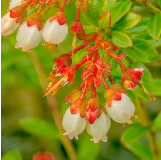
Photo by Roger Hammer. Photograph belongs to the photographer who allows use for FNPS purposes only. Please contact the photographer for all other uses.