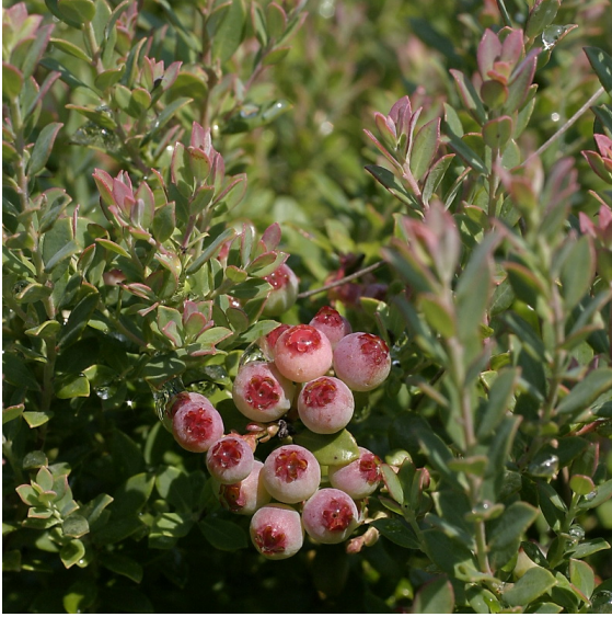
Photo by Shirley Denton. Photograph belongs to the photographer who allows use for FNPS purposes only. Please contact the photographer for all other uses.