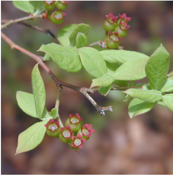
Photo by Shirley Denton. Photograph belongs to the photographer who allows use for FNPS purposes only. Please contact the photographer for all other uses.