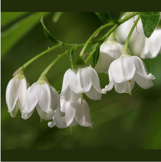
Photo by Paul Rebman. Photograph belongs to the photographer who allows use for FNPS purposes only. Please contact the photographer for all other uses.