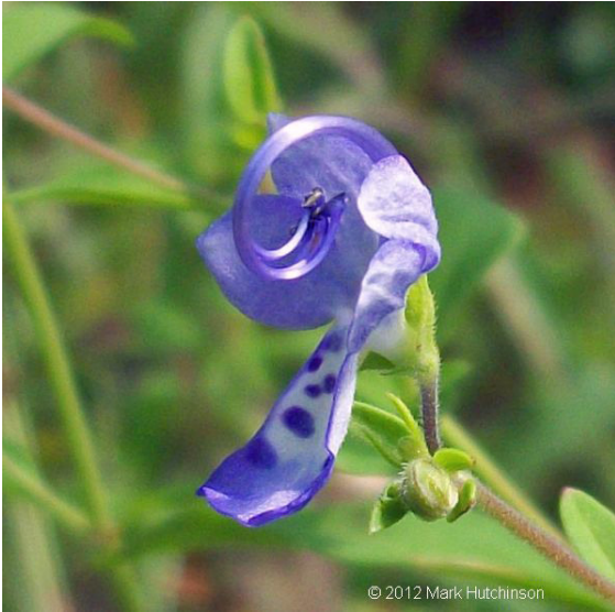
Photo by Mark Hutchinson. Photograph belongs to the photographer who allows use for FNPS purposes only. Please contact the photographer for all other uses.