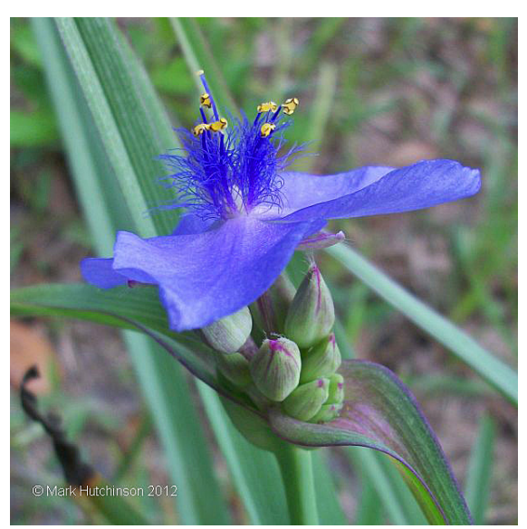
Photo by Mark Hutchinson. Photograph belongs to the photographer who allows use for FNPS purposes only. Please contact the photographer for all other uses.