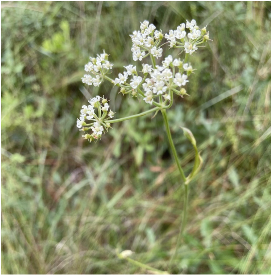
Photo by Jeannie Brodhead. Photograph belongs to the photographer who allows use for FNPS purposes only. Please contact the photographer for all other uses.