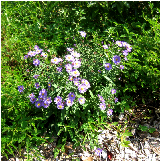
Photo by Ginny Stibolt. Photograph belongs to the photographer who allows use for FNPS purposes only. Please contact the photographer for all other uses.