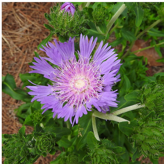
Photo by Marjorie Shropshire. Photograph belongs to the photographer who allows use for FNPS purposes only. Please contact the photographer for all other uses.