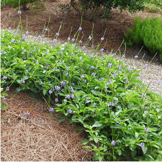
Photo by Marjorie Shropshire. Photograph belongs to the photographer who allows use for FNPS purposes only. Please contact the photographer for all other uses.