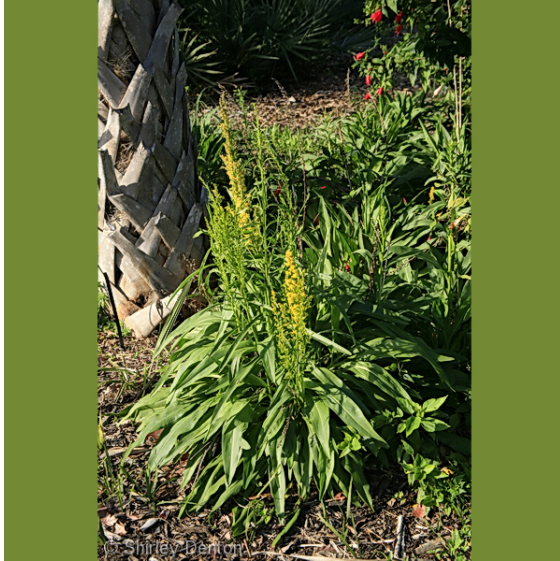
Photo by Shirley Denton. Photograph belongs to the photographer who allows use for FNPS purposes only. Please contact the photographer for all other uses.