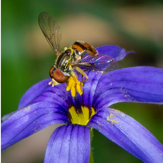
Photo by John Lampkin. Photograph belongs to the photographer who allows use for FNPS purposes only. Please contact the photographer for all other uses.