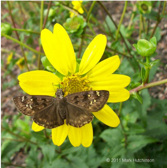
Photo by Mark Hutchinson. Photograph belongs to the photographer who allows use for FNPS purposes only. Please contact the photographer for all other uses.