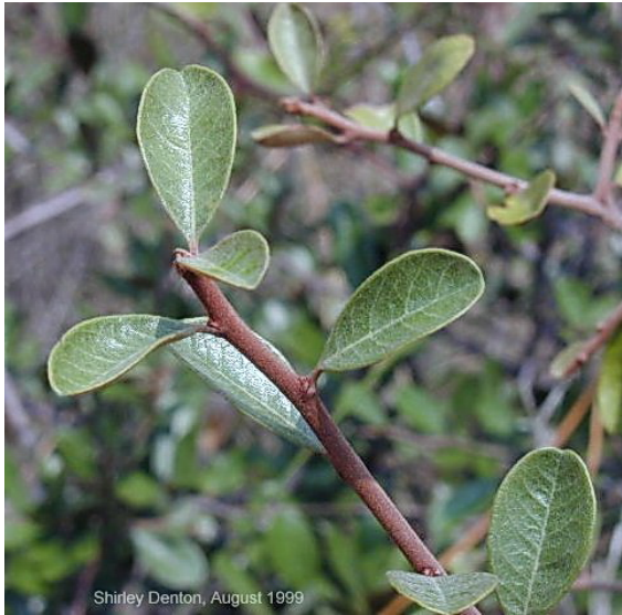
Shirley Denton, August 1999

Photo by Shirley Denton. Photograph belongs to the photographer who allows use for FNPS purposes only. Please contact the photographer for all other uses.