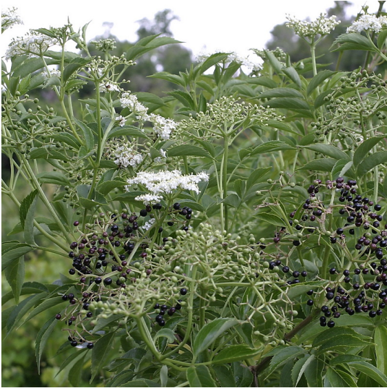
Photo by Shirley Denton. Photograph belongs to the photographer who allows use for FNPS purposes only. Please contact the photographer for all other uses.