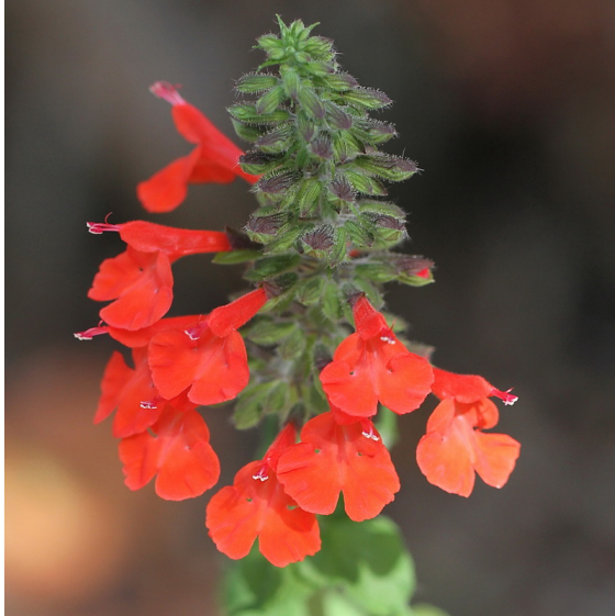
Photo by Shirley Denton. Photograph belongs to the photographer who allows use for FNPS purposes only. Please contact the photographer for all other uses.