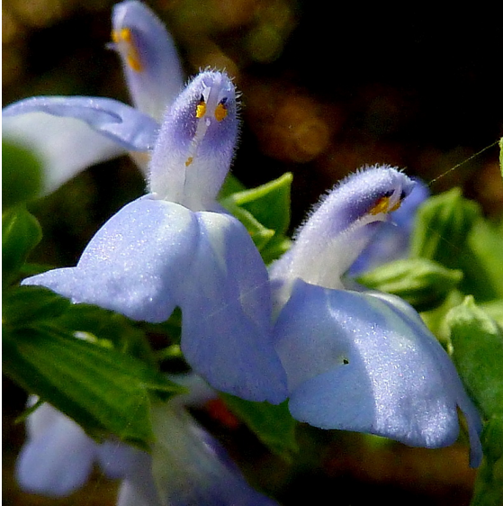
Photo by Eleanor Dietrich. Photograph belongs to the photographer who allows use for FNPS purposes only. Please contact the photographer for all other uses.