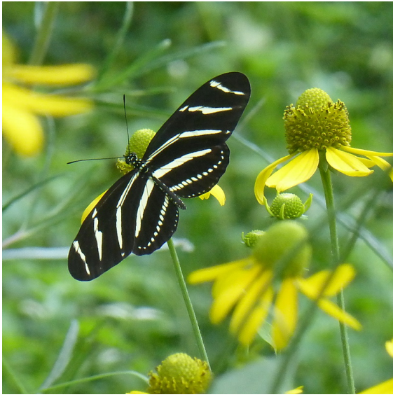
Photo by Janet Bowers. Photograph belongs to the photographer who allows use for FNPS purposes only. Please contact the photographer for all other uses.