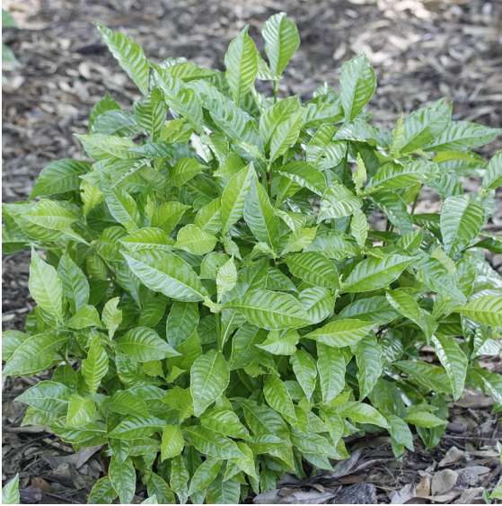
Photo by Shirley Denton, Suncoast Chapter FNPS. Photograph belongs to the photographer who allows use for FNPS purposes only. Please contact the photographer for all other uses.