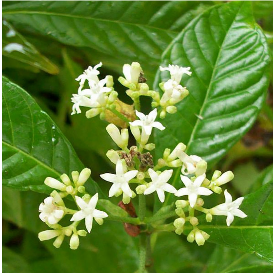
Photo by Mark Hutchinson. Photograph belongs to the photographer who allows use for FNPS purposes only. Please contact the photographer for all other uses.