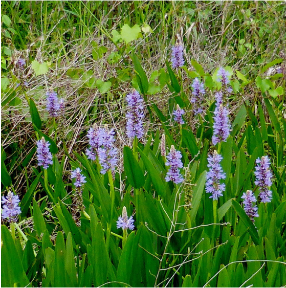
Photo by Eleanor Dietrich. Photograph belongs to the photographer who allows use for FNPS purposes only. Please contact the photographer for all other uses.