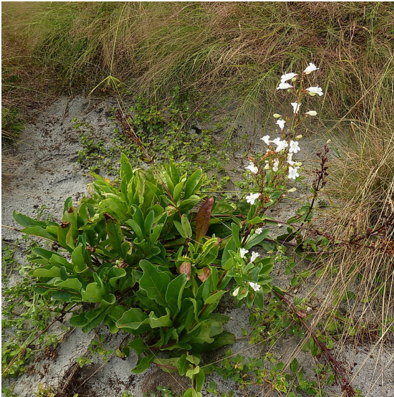
Photo by Eleanor Dietrich. Photograph belongs to the photographer who allows use for FNPS purposes only. Please contact the photographer for all other uses.