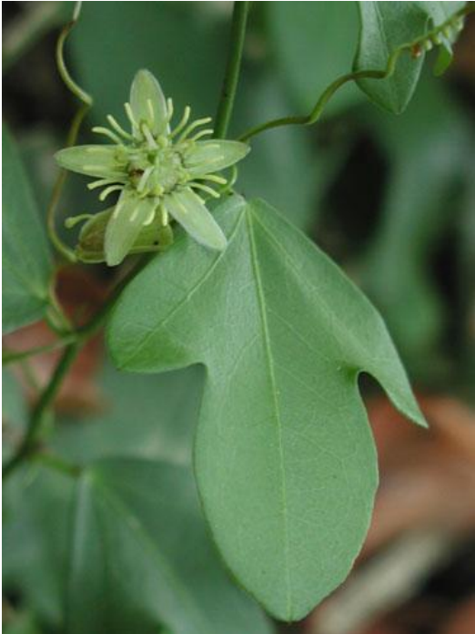
Photo by Susan Trammel. Photograph belongs to the photographer who allows use for FNPS purposes only. Please contact the photographer for all other uses.