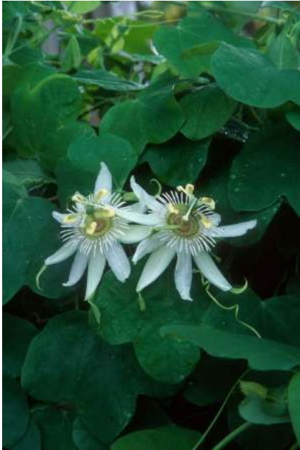
Photo by Roger Hammer. Photograph belongs to the photographer who allows use for FNPS purposes only. Please contact the photographer for all other uses.