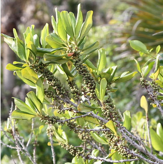
Photo by Shirley Denton. Photograph belongs to the photographer who allows use for FNPS purposes only. Please contact the photographer for all other uses.