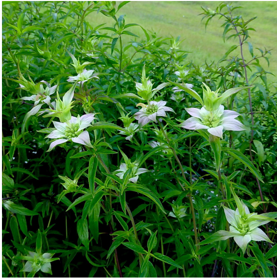
Photo by Eleanor Dietrich. Photograph belongs to the photographer who allows use for FNPS purposes only. Please contact the photographer for all other uses.