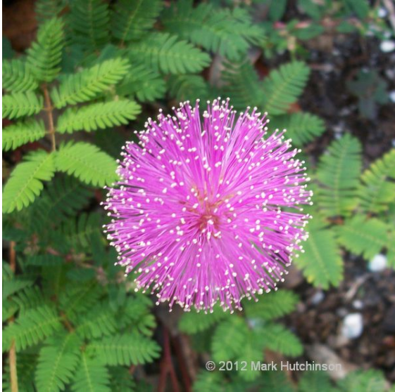
Photo by Mark Hutchinson. Photograph belongs to the photographer who allows use for FNPS purposes only. Please contact the photographer for all other uses.