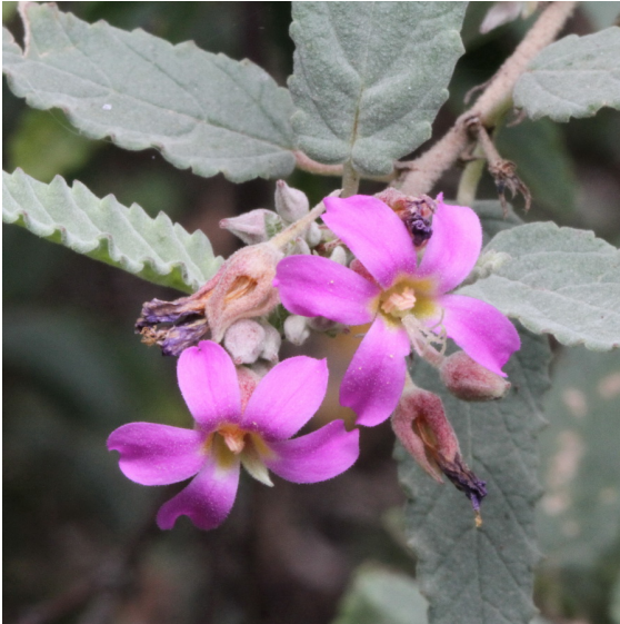
Photo by Shirley Denton. Photograph belongs to the photographer who allows use for FNPS purposes only. Please contact the photographer for all other uses.