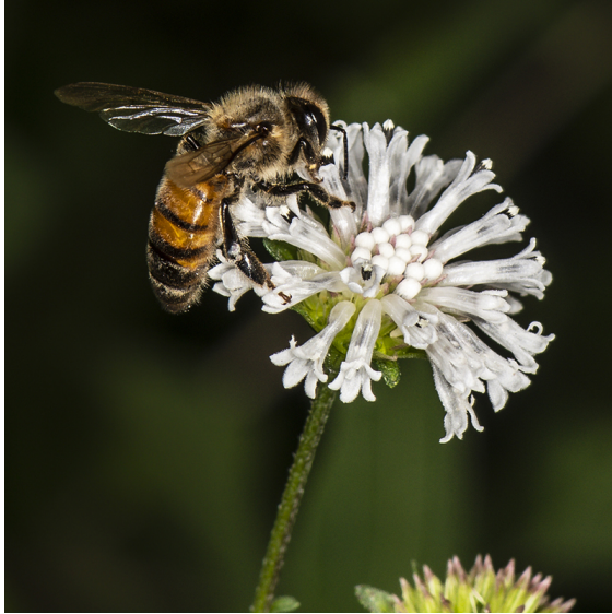
Photo by John Lampkin. Photograph belongs to the photographer who allows use for FNPS purposes only. Please contact the photographer for all other uses.