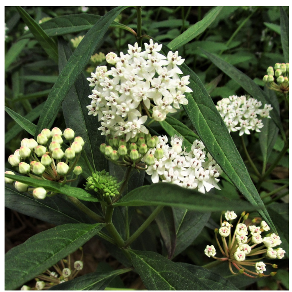
Photo by Ginny Stibolt. Photograph belongs to the photographer who allows use for FNPS purposes only. Please contact the photographer for all other uses.