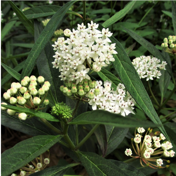
Photo by Ginny Stibolt. Photograph belongs to the photographer who allows use for FNPS purposes only. Please contact the photographer for all other uses.