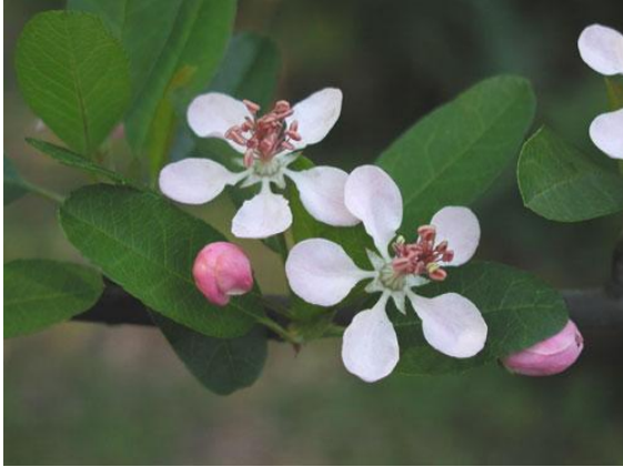
Photo by Susan Trammel. Photograph belongs to the photographer who allows use for FNPS purposes only. Please contact the photographer for all other uses.