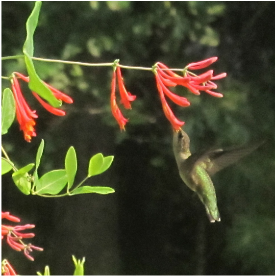
Photo by Ginny Stibolt. Photograph belongs to the photographer who allows use for FNPS purposes only. Please contact the photographer for all other uses.