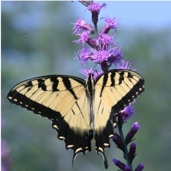
Photo by Shirley Denton. Photograph belongs to the photographer who allows use for FNPS purposes only. Please contact the photographer for all other uses.