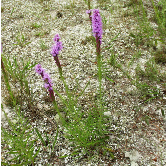
Photo by Shirley Denton, Suncoast Chapter. Photograph belongs to the photographer who allows use for FNPS purposes only. Please contact the photographer for all other uses.