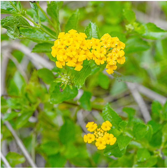
Photo by Roger Hammer. Photograph belongs to the photographer who allows use for FNPS purposes only. Please contact the photographer for all other uses.