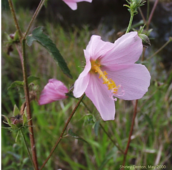
Photo by Shirley Denton. Photograph belongs to the photographer who allows use for FNPS purposes only. Please contact the photographer for all other uses.