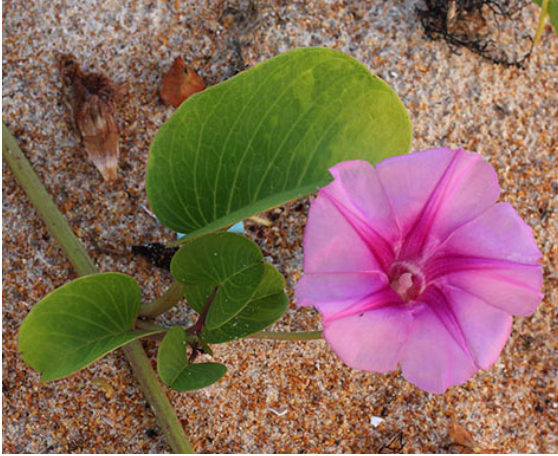
Photo by Paul Rebman. Photograph belongs to the photographer who allows use for FNPS purposes only. Please contact the photographer for all other uses.