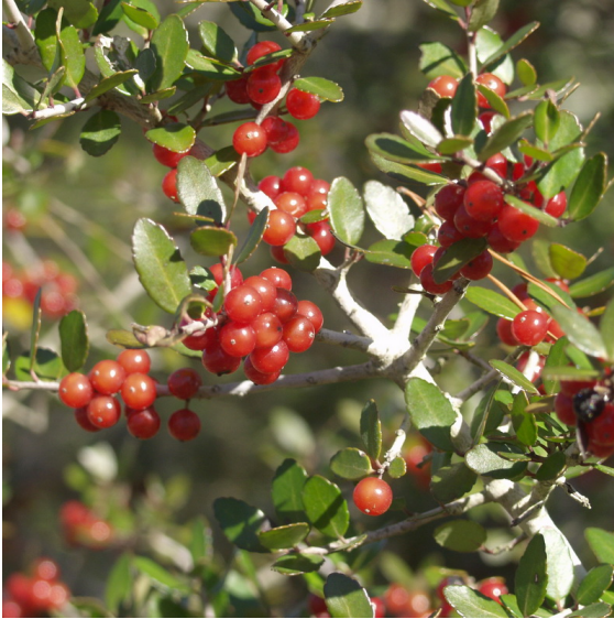
Photo by Shirley Denton. Photograph belongs to the photographer who allows use for FNPS purposes only. Please contact the photographer for all other uses.