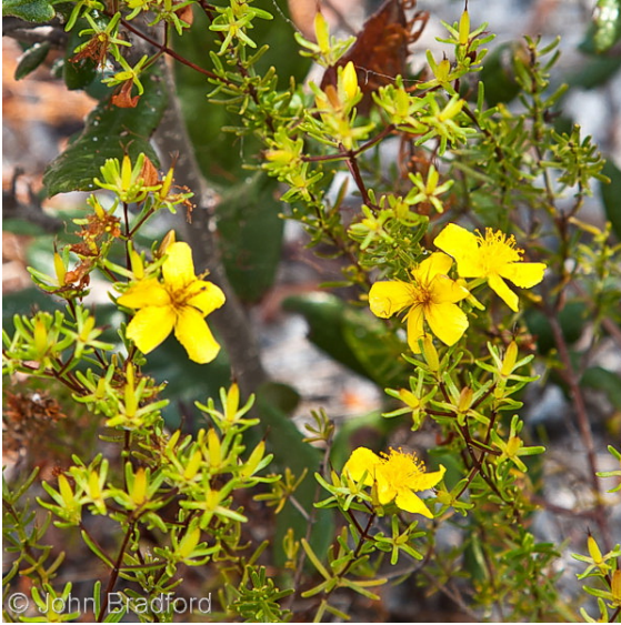
© John Bradford Photo by John Bradford. Photograph belongs to the photographer who allows use for FNPS purposes only. Please contact the photographer for all other uses.